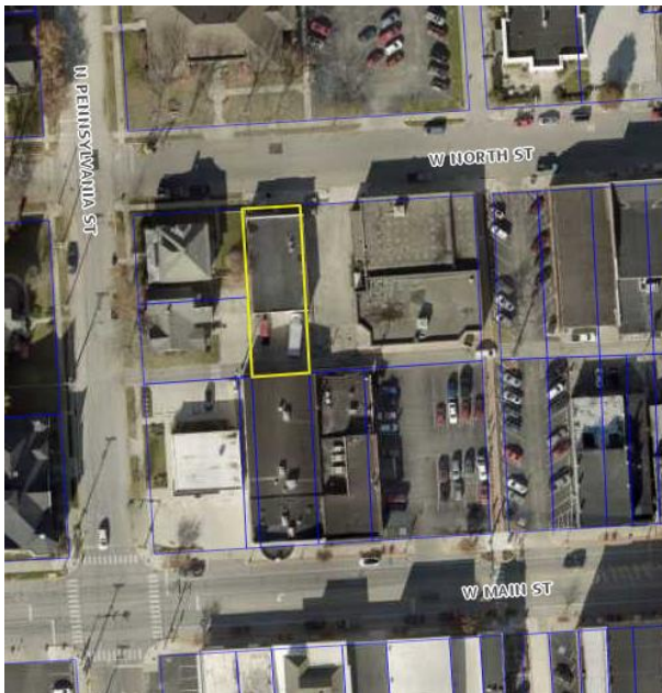
Aerial Site Location

North DT Downtown & Historic District – Commercial South DT Downtown & Historic District – Commercial East DT Downtown & Historic District – Utility Building (AT&T) West DT Downtown & Historic District – Residential